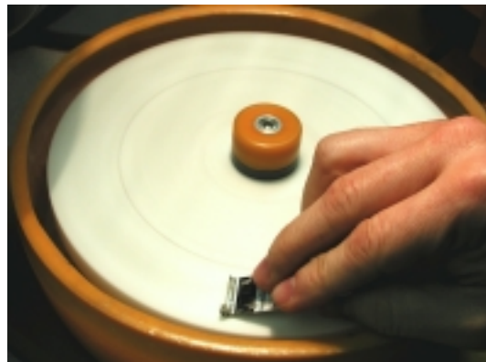
Charging the lap...