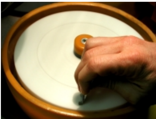
Scrape off all excess Voodoo.