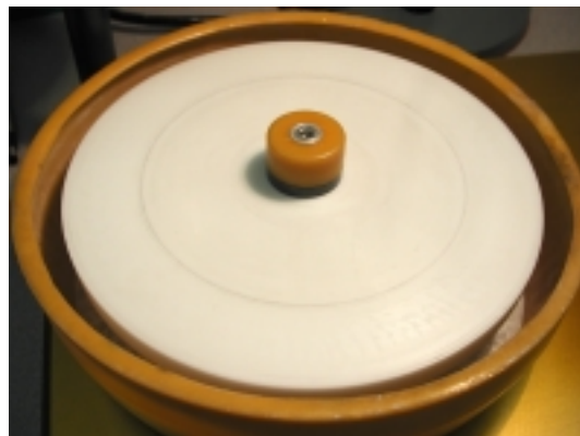
This is a fully-charged lap.